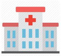
Hospitals and Clinics