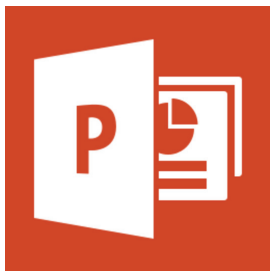
Create a PowerPoint