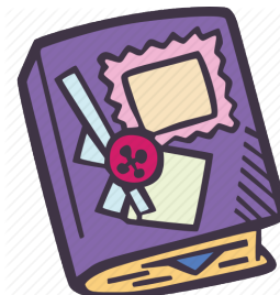
Make a scrapbook