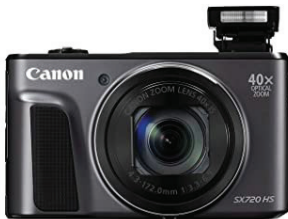
Using a Camera