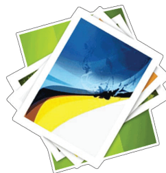
Make a photo album