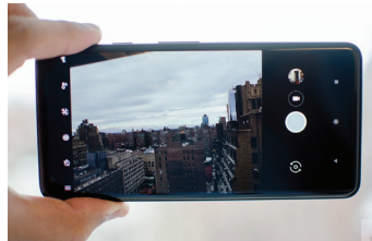
Using Your Cellphone